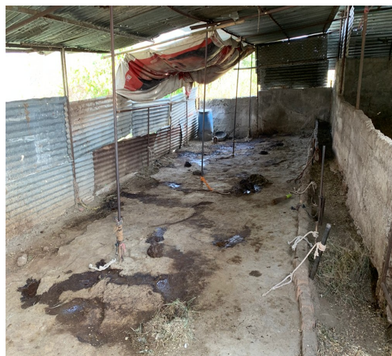
COW STABLE OF VARHAD

families (of prisoners) at any given time who do not have their own accommodation or means of livelihood after their release. The Rehab Center has a farm with cows and produces over 800 liters of milk every month and provides full time employment to the released prisoners and their families, at a given point of time. These families get free lodging, boarding, limited milk supply for consumption and also monthly stipend until they are able to obtain a job.