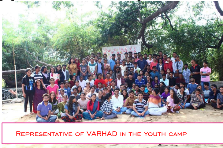
REPRESENTATIVE OF VARHAD IN THE YOUTH CAMP

There has been a growing concern to respond to the needs of the under-served population in Vidarbha region. VARHAD is collaborating with various