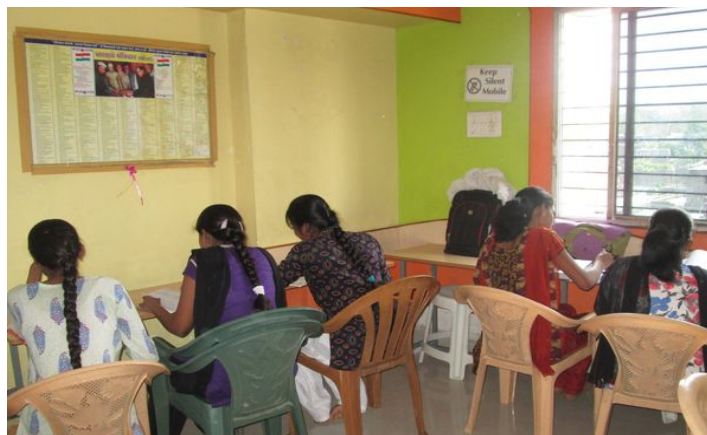
THE SAMRAT ASHOK STUDY CENTRE, AMRAVATI

toilet facilities. The reading rooms are open between 8 am to 10 pm every day. We have a corpus of over 1000 books for our students in it. The library, hostel and the career development programme for the youth is supported by local contributions and a nominal user fee levied from the youth. Over 200 of the youths have secured government jobs by utilizing the services provided by VARHAD. Several of the successful candidate contribute towards this cause and volunteer to provide career guidance to the aspirants. We aim to create a sustainable