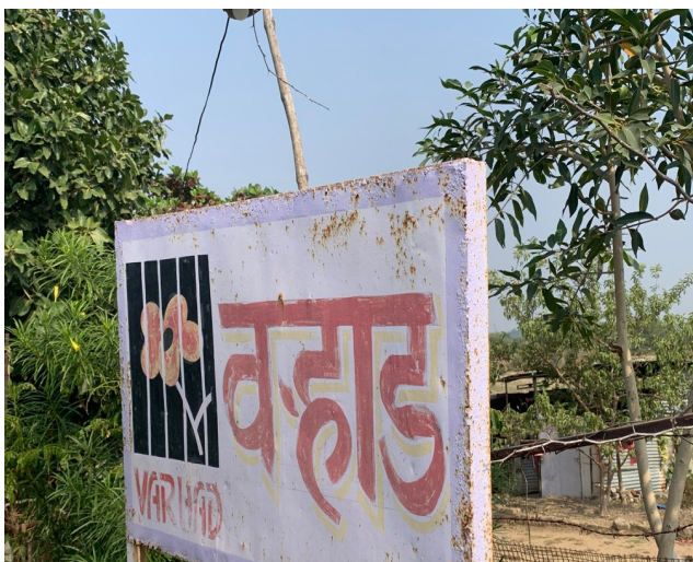
REHABILITATION CENTRE OF VARHAD