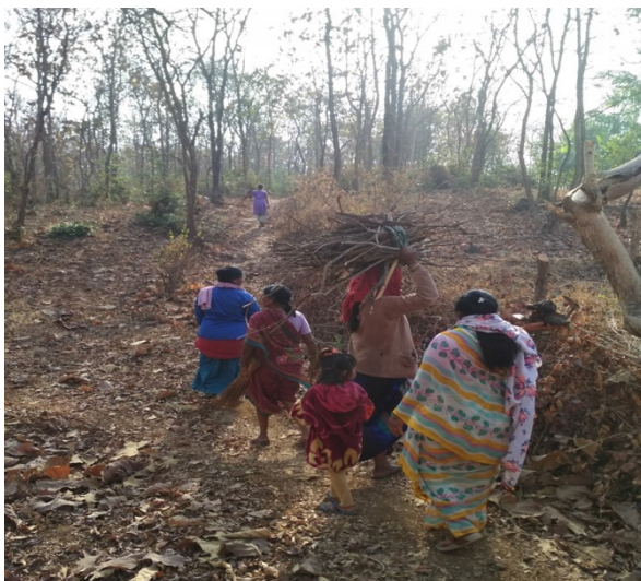
PARTICIPANT OF KAFF ZANJIRA

d. KAFF ZANJIRA: With the generous contribution of individual donors, VARHAD