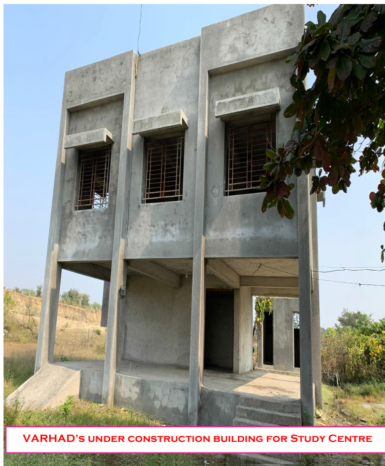
VARHAD'S UNDER CONSTRUCTION BUILDING FOR STUDY CENTRE

challenges particularly in the area of mental health, education, livelihood opportunity, youth development and farmers' empowerment. VARHAD especially focuses on women and youth development in the Vidarbha region in view of the growing needs to address developmental challenges. Facilitating the women and youths for education, skill development and career