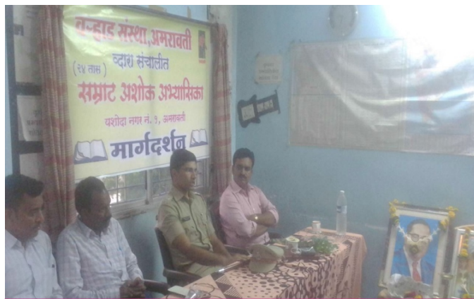
CAREER GUIDANCE SESSION AT THE SAMRAT ASHOK STUDY CENTRE

VARHAD has been running a library facility for the youth both male and female since the early 2014. In addition to the library facilities, we also provide residential facilities by