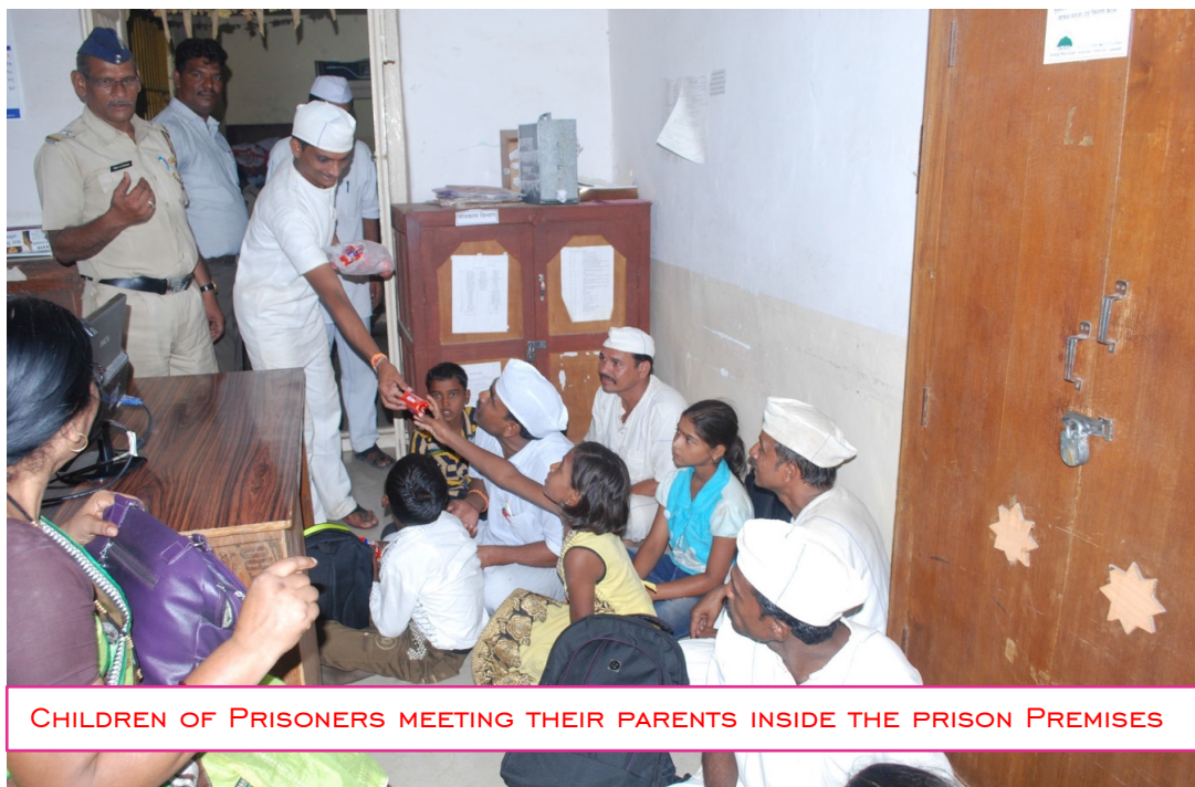
CHILDREN OF PRISONERS MEETING THEIR PARENTS INSIDE THE PRISON PREMISES